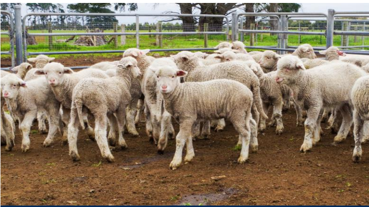
Lambs from the TPM FLOCK BOOST Group