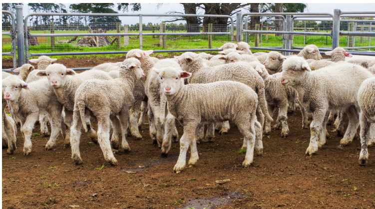
Lambs from the TPM FLOCK BOOST Group