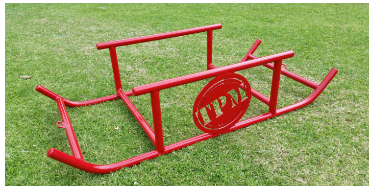
Example of a mineral tub holder

or visit www.tracperformanceminerals.com